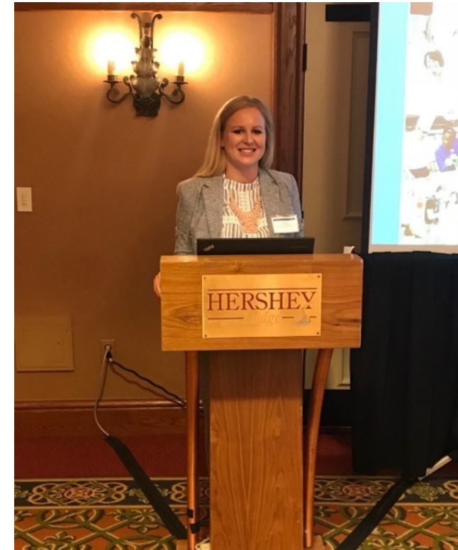
Presentation at Eastern States (May)